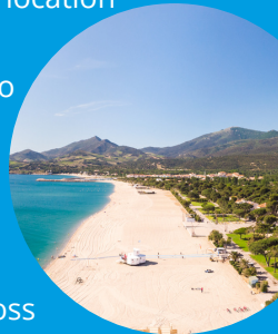
Beach at Argelès sur Mer

The Catalan country is renowned for its beauty and its amazing location between the sea and mountains. It is home to the gorgeous village of Collioure and the medieval city of Castelnou. Only 30kms from the campsite, across the border you will find the spanish town of Empuriabrava with its delightful canals.