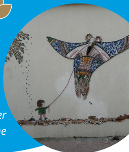
The l'Île Penotte Quarter in Sables d'Olonne

Massages du monde by appointment. Contact: Estelle+33 6 07 16 33 74