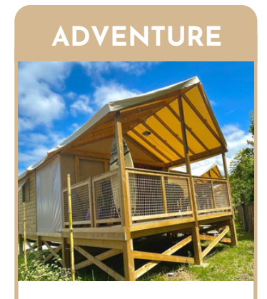
Elevated lodge with shower and toilet Wi-Fi