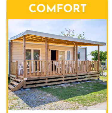
Mobil-home récent avec terrasse couverte. Mobil-home PMR & TV & Accès Wifi