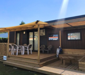
A modern mobile-home with covered deck 2 shower rooms Heating in the bedrooms TV & Wi-Fi